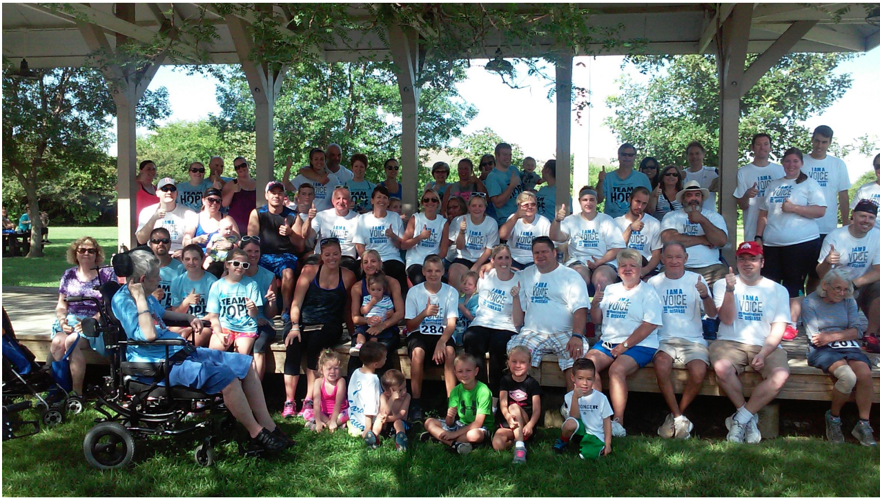
Thumbs up for the “winners” of the Hilliard Team Hope 5K!

We are united by a common experience, purpose, and hope. Together we can!